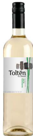
Tolten by Carmen Sauvignon Blanc 12 x 750mL | Licensee $10.49 | Retail $13.95

Greenish-yellow in colour with aromas of flint and minerals. A delicious wine recalling fresh and juicy citrus fruit with notes of grapefruit, pepper, and orange leaves. Pleasing varietal typicity. Fresh with a long finish.