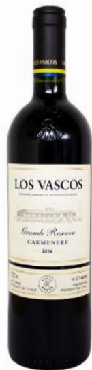
2016 Los Vascos Grande Reserve Carmenere 12 x 750mL | Licensee $25.49 | Retail $30.95

This bright ruby-colored Carmenère has an intense, rich, fruit-scented nose of cherries, redcurrants, and plums with hints of black and pink pepper, red bell pepper, green olives and cinnamon. The palate offers generous notes of cocoa and cherry liqueur, accompanied by copious, lingering tannins. A remarkably fine expression of the Carmenère grape.