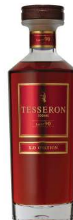
Lot No 90 XO Ovation Cognac 1 x 700mL | Licensee $159.07 | Retail $184.95

Very fresh pear & quince notes on attack, give way to herbaceous elements, dried fruits and nuts, fresh, with intriguing hints of almond. Firm, focussed, powerful, reflecting the aromatics presented by the nose – young, quality cognac.