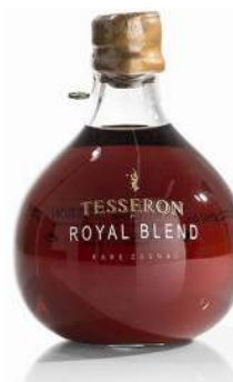
Royal Blend Cognac 1 x 700mL | Licensee $2,123.67 | Retail $2,499.95

An extremely appetizing cognac, opulent, rounded and yet vivacious. Pepper & spices emerge initially before revealing dark chocolate and fresh herbs. Complex, it shows supreme finesse, supple and very good length.