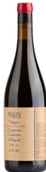
Prugneto Estate Sangiovese Superiore, Romagna DOC

Bright straw-yellow in colour. Intense, delicate and persistent perfume, with aromatic character. Pleasantly fruity and fresh with a good minerality. Well-balanced and structured in all its components. Pairs best with shellfish hors d'oeuvres, hand-made pasta, roasted and grilled fish and white meat.