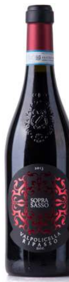
Soprasasso Valpolicella Ripasso, DOC 12 x 750mL | Licensee $20.49 | Retail $25.45

Bright, intense red colour, fragrant and pleasantly delicate to the nose with hazelnut scents, this red wine is dry and velvety, full-bodied and harmonious. Serve at 16°-18°C. Perfectly paired with meat and roasts.