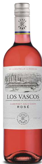
2017 Los Vascos Rosé 12 x 750mL | Licensee $16.99 | Retail $21.95

Los Vascos' rosé is made from grapes which are pressed immediately after harvesting. This preserves the freshness, the fruity aromas and the bright colour brought of the juice straight from the vineyard. It is best to drink this wine young to fully enjoy its lively character and finesse.