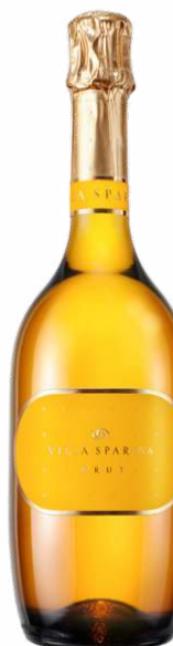
Villa Sparina Brut Blanc de Blancs 12 x 750mL | Licensee $33.89 | Retail $35.95

Fruity with a scent of peach, fresh and well balanced. A pure, rich sparkling wine with a full body and a round texture. Flavourful. Lots of character and beauty.