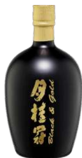
Gekkeikan Black & Gold Junmai Sake 6 x 750mL | Licensee $24.99 | Retail $30.95

Full-bodied with hints of honeydew, papaya, anise and roasted nuts. Well-balanced with a long and smooth finish; it is a great sipping sake. This versatile food sake complements duck, grilled chicken and pork; scallops and steamed shellfish dishes. To fully appreciate Black & Gold's complexity and nuances, enjoy slightly chilled or at room temperature.