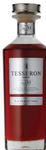
Lot No 53 XO Perfection Cognac 1 x 700mL | Licensee $599.99 | Retail $684.95

Very fresh pear & quince notes on attack, give way to herbaceous elements, dried fruits and nuts, fresh, with intriguing hints of almond. Firm, focussed, powerful, reflecting the aromatics presented by the nose – young, quality cognac.